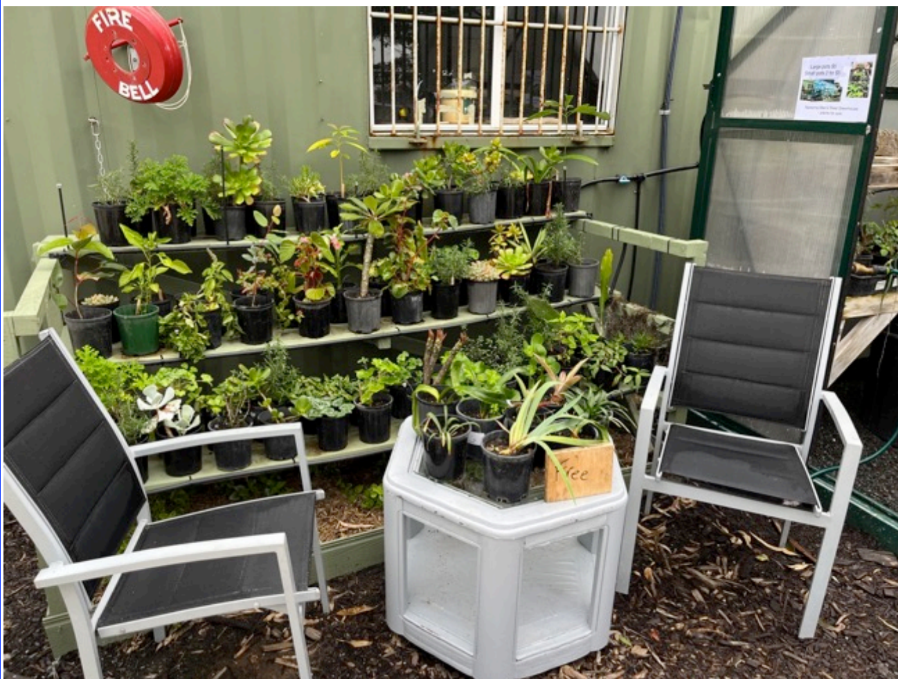
Plants are burgeoning at the Markets