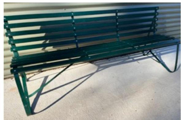
Finished product – good as new